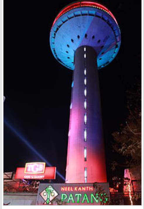
Patang Hotel Front View at Night