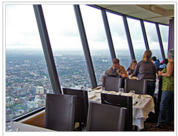
Inside the 360 Restaurant at the CN Tower, Toronto