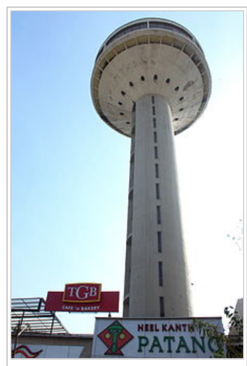
Patang Hotel, a revolving restaurant that provides views of the city of Ahmedabad, India