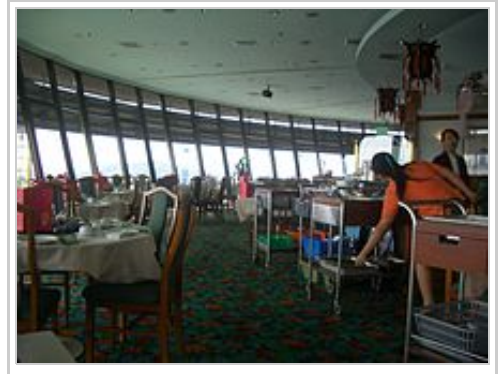
Prima Tower (Singapore) dining area showing an example of a revolving restaurant