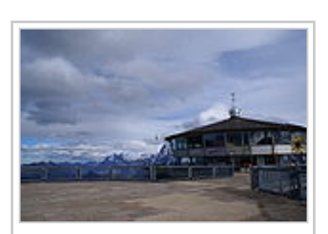
The Piz Gloria, summit of Schilthorn