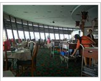
Prima Tower Revolving Restaurant, Singapore